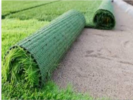
Artificial Grass Sand