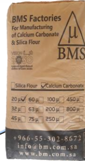
25/50 KG Paper Bags