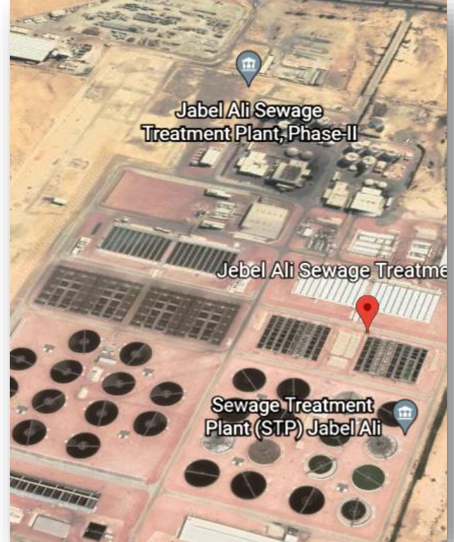
JEBEL ALI SEWAGE TREATMENT PLANT