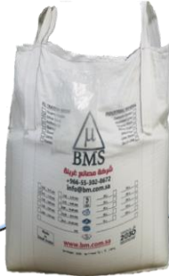
1.6 Ton Jumbo Bags