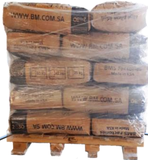
50 KG Paper Bags