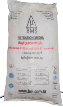
50 Kg pp Bag