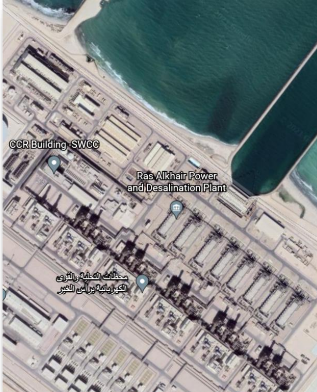
RAS ALKHAIR DESALINATION PLANT